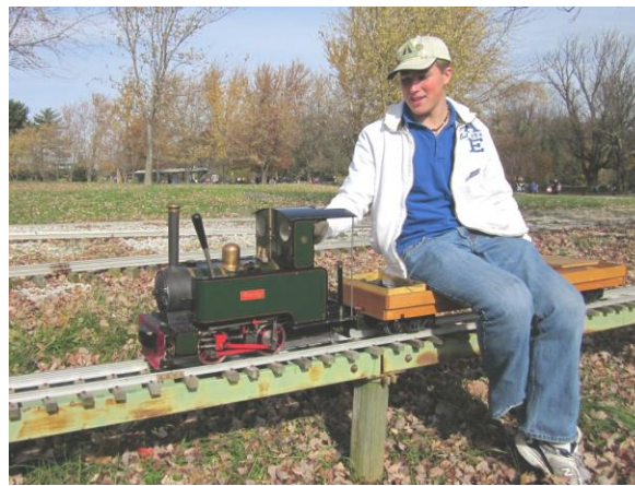
1" scale Locomotive on Elevated Track

The public is encouraged to participate on our monthly Public Run Days.