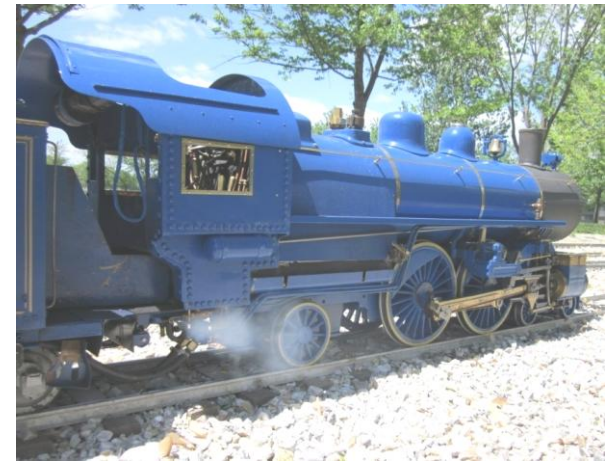
1 1/2" scale 4-4-2 Atlantic Coal-fired Steam Locomotive

The railroad is part of a privately financed, operated, and maintained miniature steam power museum. It is not an amusement concession. We demonstrate steam power in other ways although the railroad is most visible. The tracks were built by our members, without City, State, or Federal aid and are owned by the Society. The locomotives are privately owned so trains run only when their owners can make them available.