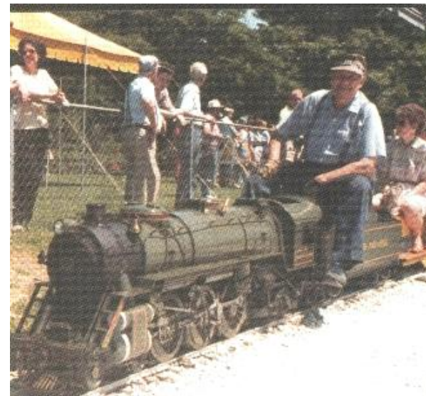
Coal-fired 4-6-2 Pacific (1.6" scale)

On the 2nd Sunday of each month April thru November 11 AM to 3:30 PM