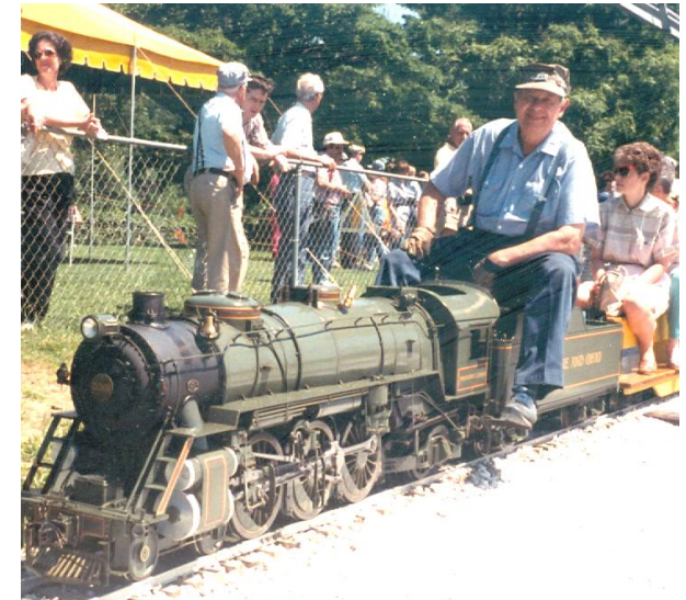
Coal-fired 4-6-2 Pacific (1.6" scale)

On the 2nd Sunday of each month April thru November 11 AM to 3:30 PM