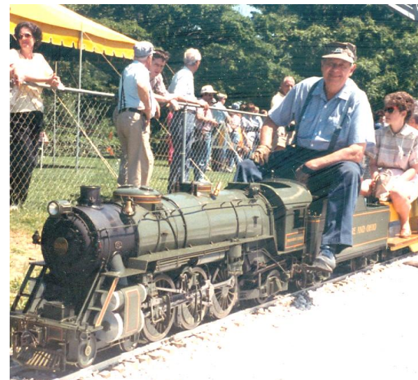
Coal-fired 4-6-2 Pacific (1.6" scale)

On the 2nd Sunday of each month April thru November 11 AM to 3:30 PM