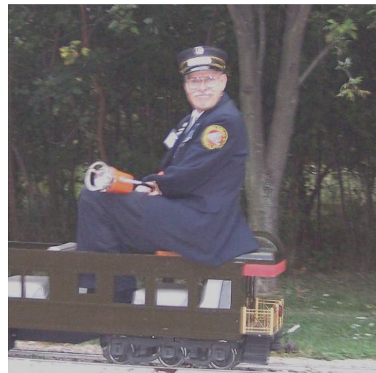
Tim Allen sports his new mustache. Really, it's where they usually are.