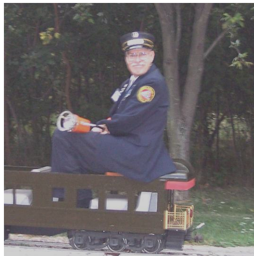
Tim Allen sports his new mustache. Really, it's where they usually are.