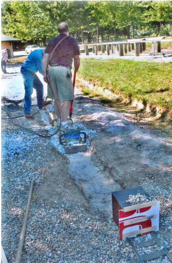
Tamping Last Full Piece; Gaping Gap