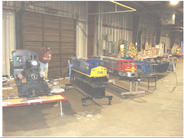
Display tables with posters for sale and Mike Looney's loco parts