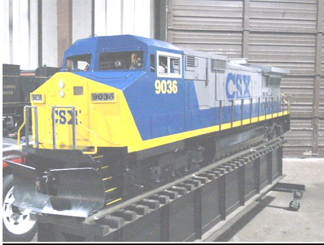
Bob Schwoerer's faithful CSX diesel