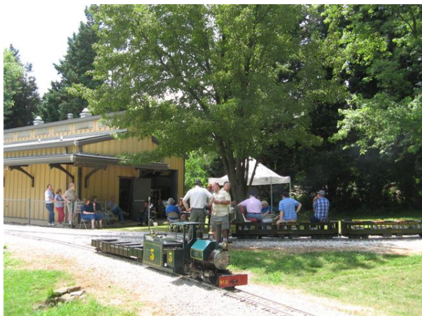
Waiting for the Meeting To Start