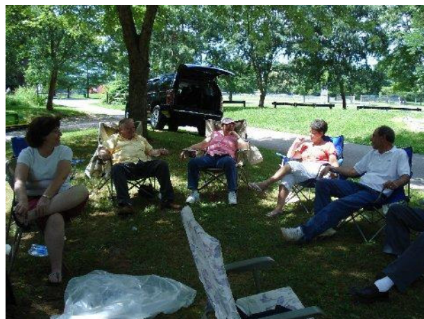
Lazin' About During the Day