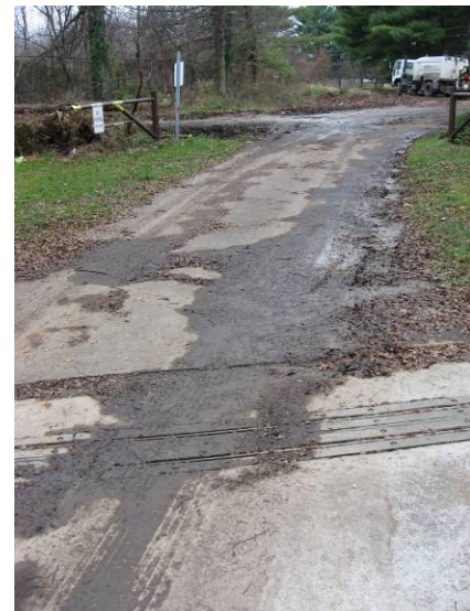
Bad News Is the Coming Work To Clean the Crossing