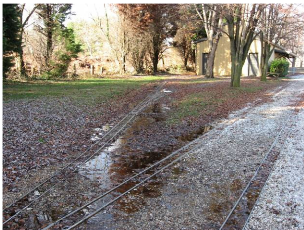
We Thought It Was Rain Run-off

In last month's Activity Notes there was mention of the water pipe running through the City's leaf dump had again been compromised. As of late January there still was no water, but some heavy duty plastic water pipe had been delivered. Here's hoping the line gets fixed soon. And that the powers-that-be in DPW tell their dozer operators about the line. A couple of pictures: