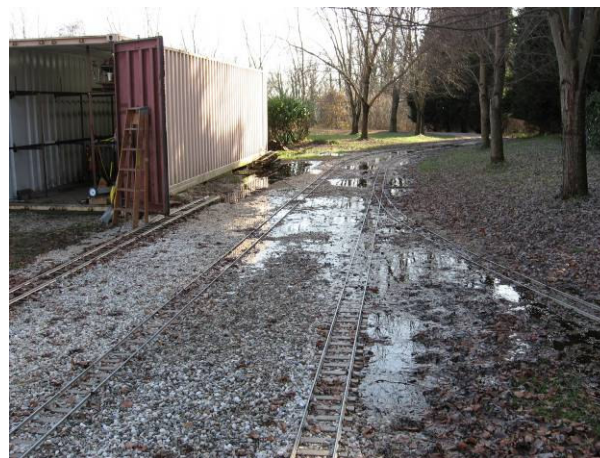
Pooling by the Container