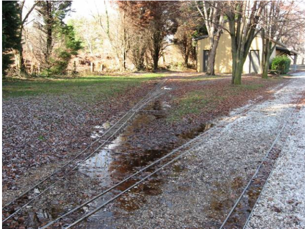
We Thought It Was Rain Run-off

In last month's Activity Notes there was mention of the water pipe running through the City's leaf dump had again been compromised. As of late January there still was no water, but some heavy duty plastic water pipe had been delivered. Here's hoping the line gets fixed soon. And that the powers-that-be in DPW tell their dozer operators about the line. A couple of pictures: