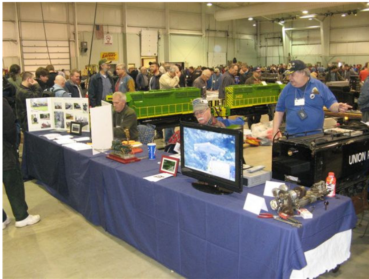
CALS Had a Substantial Display Area at Cabin Fever Here Is the Cass Display and Our New TV to Play DVDs