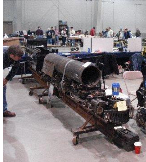
A Visitor Examines Steve's Big Boy