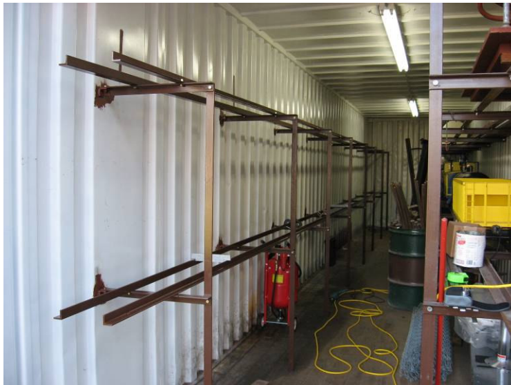
Bob Schwoerer Has Been Busy Building Rack #2 in Container #2 for Car Storage