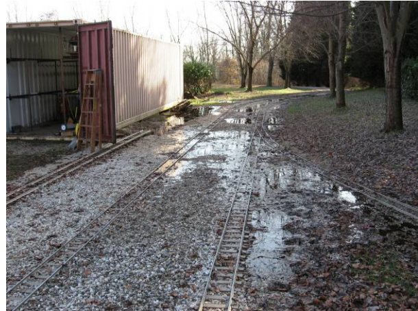
Pooling by the Container