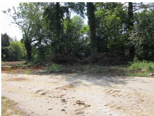
(3) And The City Done Stole 'Em by Saturday