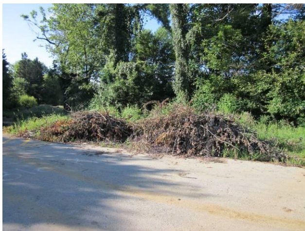
(1) Tree Trimmings on Wed. Morning