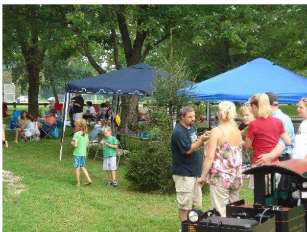
(5) The Blue Group of S-Gaugers