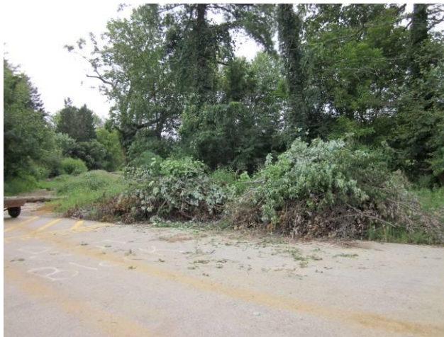
(2) Piles Grew by Wed. Afternoon