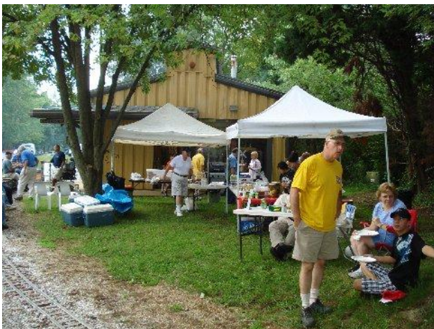
(6) And the White Team